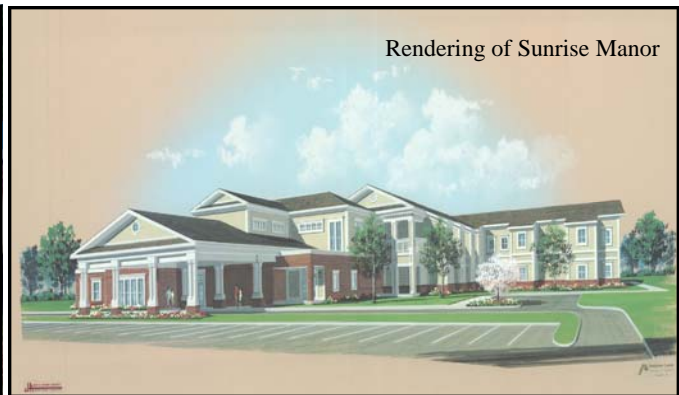
Rendering of Sunrise Manor